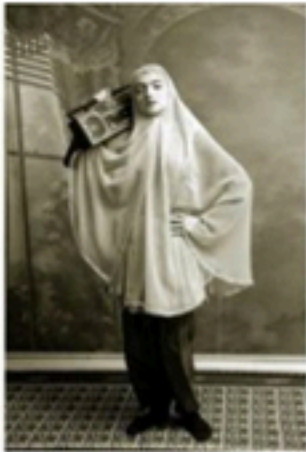
One work from Shadi Qadirian's collection entitled "Qajar"

TEHRAN -- An exhibition displaying works by Iranian photographer Shadi Qadirian and four other female Asian photographers is currently underway at Seattle's Photo Center NW.