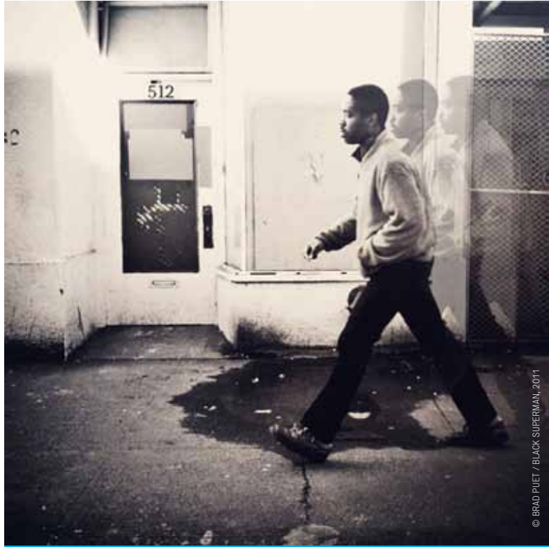
© BRAD PUET / BLACK SUPERMAN, 2011