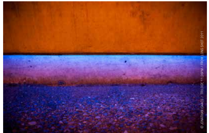
11:26PM / FROM LONG SHOT 2011