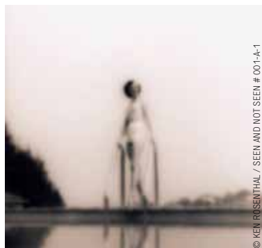
SEEN AND NOT SEEN # 001-A-1

Join us in celebrating photography, community and the Photo Center! This exciting celebratory community event will exhibit photographs taken on the same day (June 1) around the world by fierce supporters of the Photo Center. All works are priced to sell, and every sale benefits the Photo Center, so come early and add a new piece to your collection! Music, refreshments and entertainment will be provided.