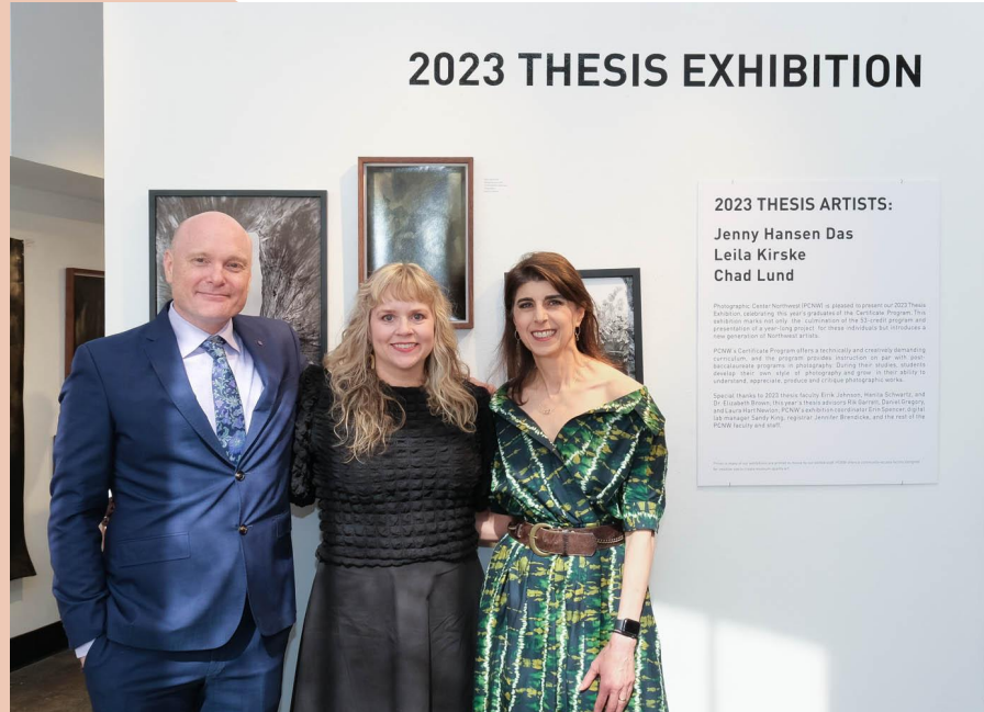
Graduates at 2023 Thesis Exhibition Reception & Graduation