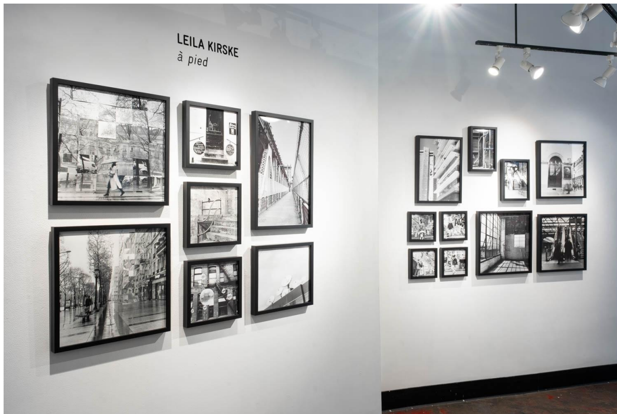
Leila Kirske à pied