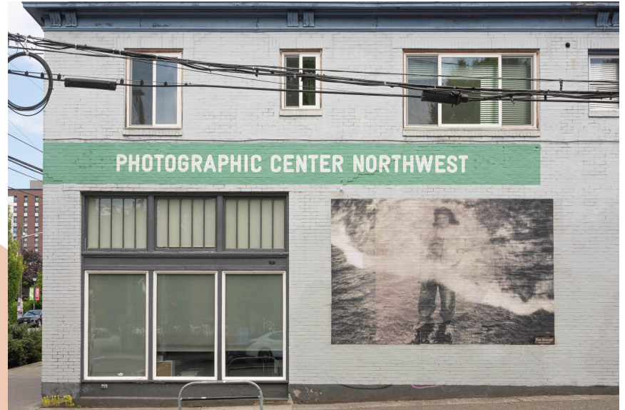
Installation detail of Gwen Emminger's work from 2022 Thesis Exhibition