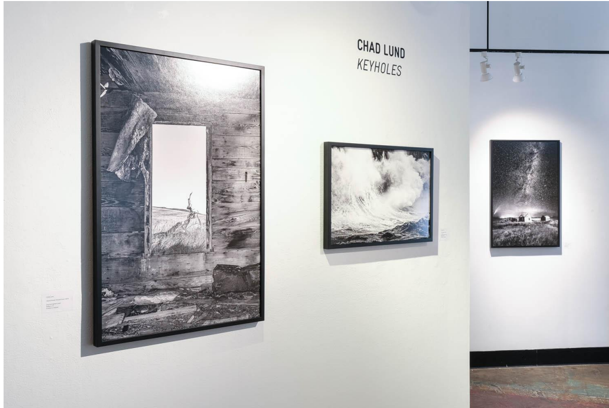
Chad Lund Keyholes