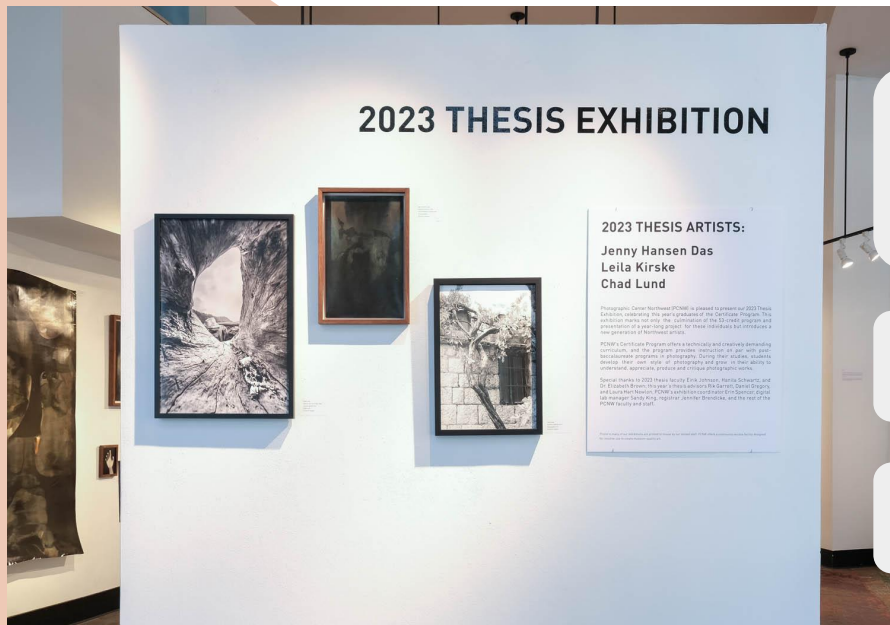
Installation view of 2023 Thesis Exhibition

Students develop their own style of photography and ability to understand, appreciate, produce and critique photographic works