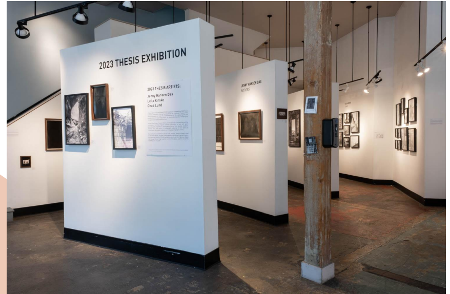
Installation detail view of 2023 Thesis Exhibition

Evening courses and small class sizes make the Certificate Program personal, flexible and accessible