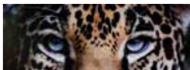
Chrysalis School