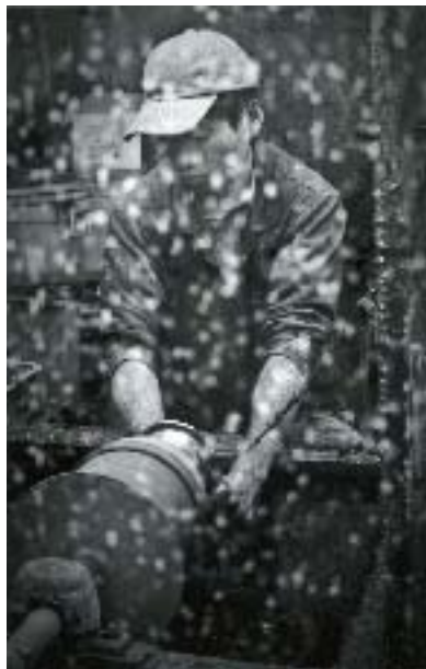
Peninsula High School 2009 Best in Show