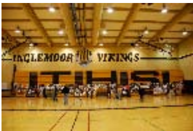
Volunteers quickly set up a category for judges to view at the Inglesmoor H.S. gym.