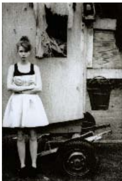
Bothell H.S. 2011 Best in Show