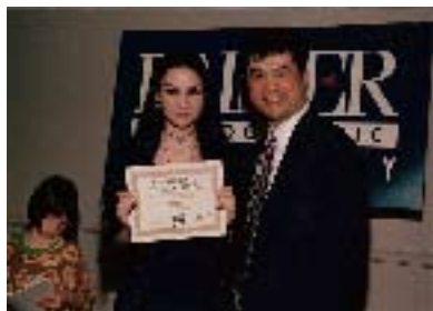
Governor Gary Locke presenting a student with a Certificate of Excellence at the Seattle Art Museum awards ceremony.