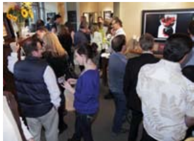
A huge crowd at opening night enjoyed pizza from Mad Pizza and Jones Soda aplenty.