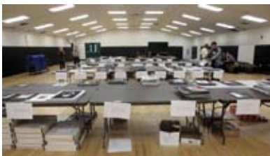
In 2011, our volunteer staff processed and sorted 4,015 entries from 75 high schools.